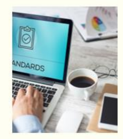
UNIFYING THE PLANTATION STANDARDS