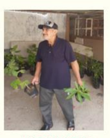
ENCOURAGING INDIVIDUALS TO PARTICIPATE IN AFFORSTATION

Enhance the awareness and responsibilities of private sector in protecting the environment