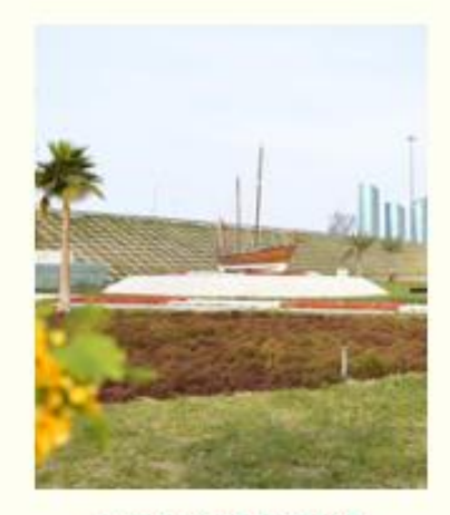
INCREASE THE NUMBER OF TREES IN GOVERMENT PROJECTS